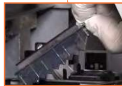
Replaceable Print Wiper