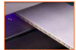
Media Thickness Detection Sensor

MUTOH's genuine VerteLith RIP software bundled with FlexiDESIGNER MUTOH Edition 21 optimizes the VJ-1638UH Mark II through these key features: