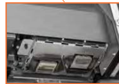
Staggered Dual Print Heads