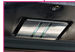
Accufine print head