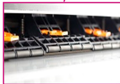
Multi-stage pressure rollers