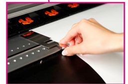
Optional Edge Holder

MUTOH's Genuine VerteLith™ RIP software bundled with complimentary one-year subscription to SAI Flexi DESIGN MUTOH Edition optimizes the XPJ-1341SR Pro by: