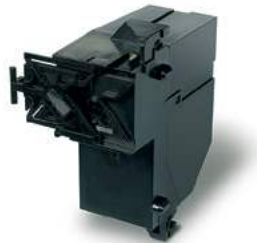
Spectrophotometer with i1 color technology from X-Rite