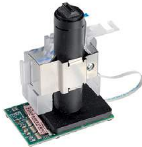
HP Optical Media Advance Sensor (OMAS)

Turn orders in record time with the fastest 60-inch production printer for graphics. 6 Offer exceptional color and black-and-white prints on many substrates with 8 HP Vivid Photo Inks. Count on advanced color management features backed by HP reliability and easy operation.