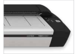
Contex Extended Data Transfer Rate improves scanner speed at high resolution