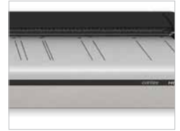
Contex ALE Technology ensures accuracy between any 2 points on the document